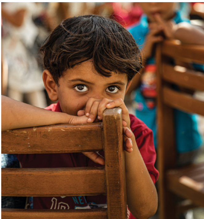
Throughout this booklet, names in quotation marks are pseudonyms, used to ensure security.